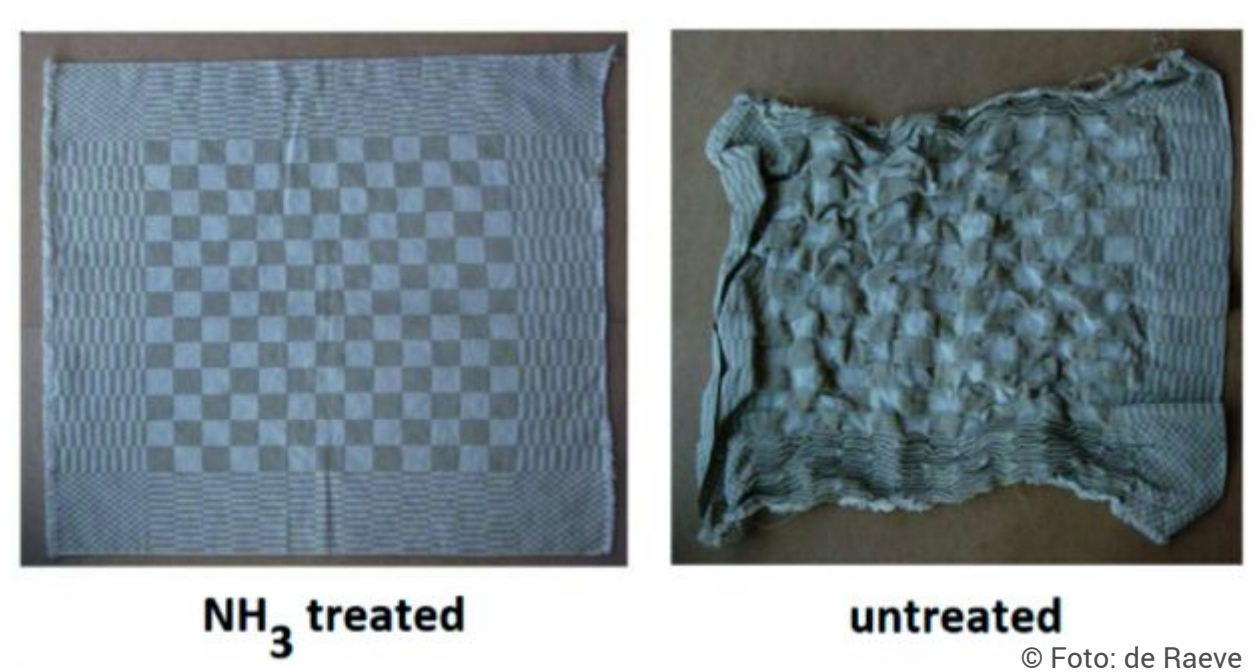
Fig. 2 Positive impact of Beau-Fixe treatment onto shape retention during washing

This study aims to give a practical insight in the transferability of the Beau-Fixe treatment from cellulosic materials like cotton and flax to hemp. The earlier mentioned physical test protocol (Table 1) has been worked out on the bleached cotton and hemp tissue selection. Results are summarized in Table 3.